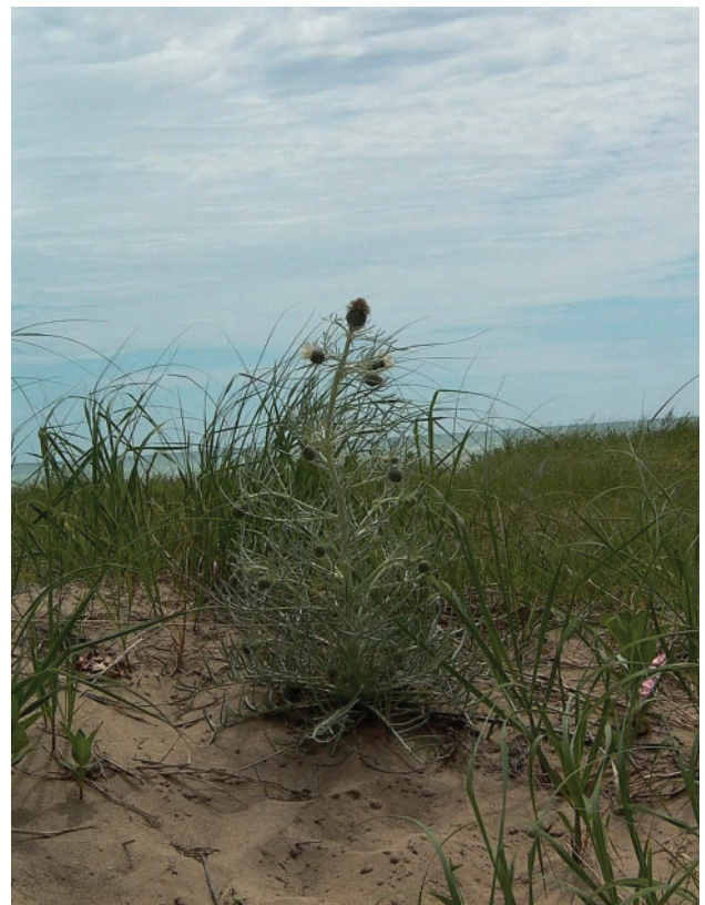
Fig. 2. Cirsium pitcheri flowering plant translocated into a restoration site in Wisconsin, USA. Introduced populations of Pitcher's thistle show a similar range of vital rates, but greater variation in these rates, than wild populations (Bell et al. 2003).

The first population viability analysis on an introduced population was accomplished by Bell et al. (2003) on Pitcher's thistle ( Cirsium pitcheri ; Fig. 2), an endemic monocarpic perennial herb that grows on sand dunes of the western Great Lakes in North America. Repeated introductions into protected land near Chicago were closely followed to obtain demographic data for transplants and naturally recruited individuals. Data on these two groups showed different